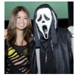
PICS: 'Friday the 13th' at Vice Nightclub