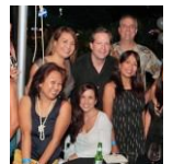
PICS: 'April Foolish' at The Standard